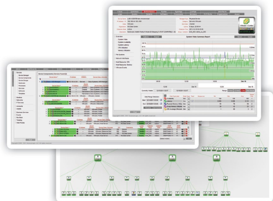
View aggregated VM alarms, performance, and availability data in a single pane of glass that is customizable to meet your specific needs.

Dashboard views monitor operating system metrics, including performance, availability, OS version, patch levels, disk utilization, web services, installed software, and all the services and processes that are running on the OS. Available for Windows, the many flavors of Linux, SunOS, HPUX, IBM, AIX, z/OS, OSX, Netware, SCO, and more, you can be sure that regardless of your environment, we have you covered.