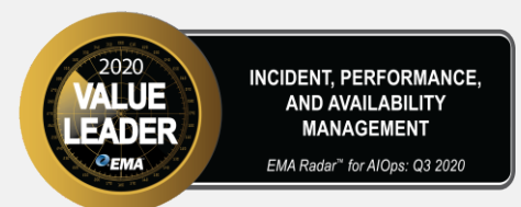
2020 EMA Radar