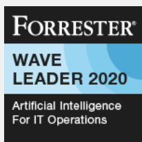
2020 Forrester Wave